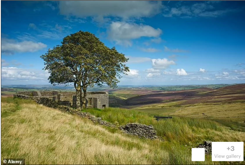
The ruined farmhouse of Top Withens, on the heath near Haworth, is said to be the origin of Cathy's home Wuthering Heights in the novel

Developers submitted a 'scoping' document for the windfarm in September, but a comprehensive environmental impact assessment must be made before they can apply for planning.