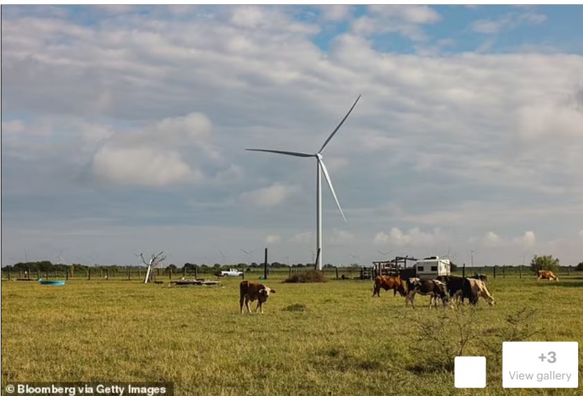
The project would see 65 towering turbines – each taller than Blackpool Tower (Pictured: Stock image of windfarm)