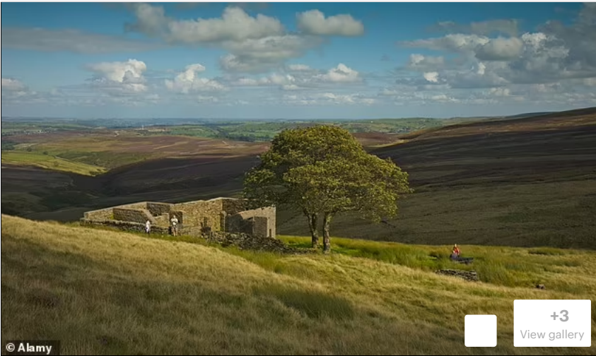
The stunning landscape that inspired Wuthering Heights is the battleground in a showdown between literature lovers and a shopping tycoon