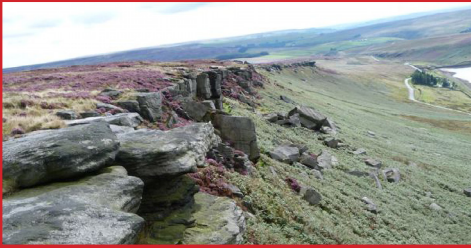
The Scout above Widdop Reservoir (T5, T59, T1, T4, T56)