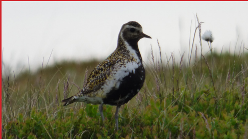
Golden plover on Walshaw Moor