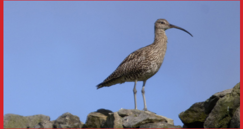
Curlew on Walshaw Moor